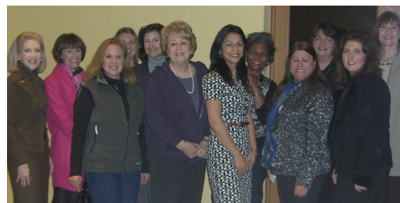
Face the Nation: Tricks of the Trade committee members recently met at Neiman Marcus to plan the event.

An exclusive beauty event for a good cause. $50 donation supports Press Club scholarships and Haitian relief.