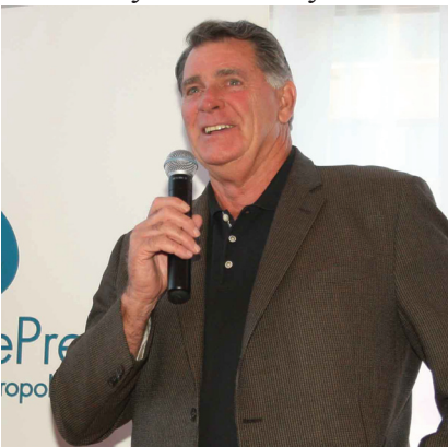
Mike Shannon

We are just a couple of months away from our Media Person of the Year Dinner honoring Mike Shannon . Given that we have been working on this dinner for more than a year, we are, in baseball parlance, entering the late innings. And, as a play-by-play man once said, "The electricity is so thick you can cut it with a butter knife."