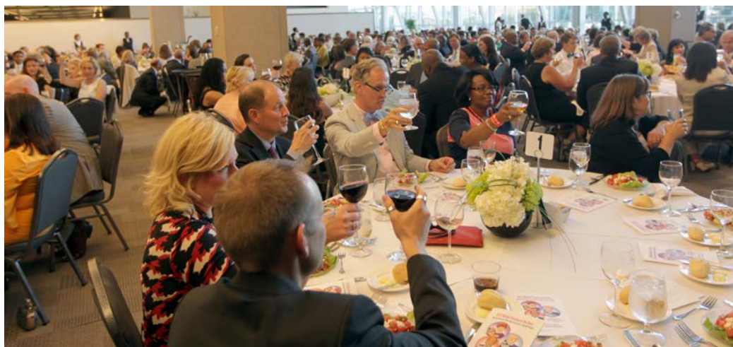
Dinner guests at the Edward Jones Atrium toasting our 2015 honorees.