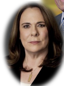
Candy Crowley former longtime political correspondent and host at CNN