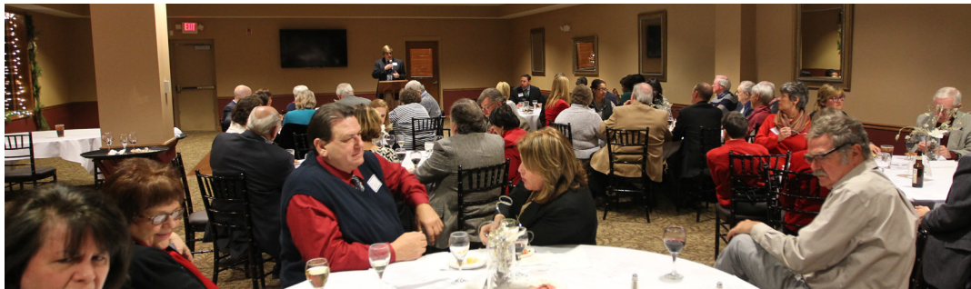
Press Club's December annual meeting and reception drew 65 members and guests.