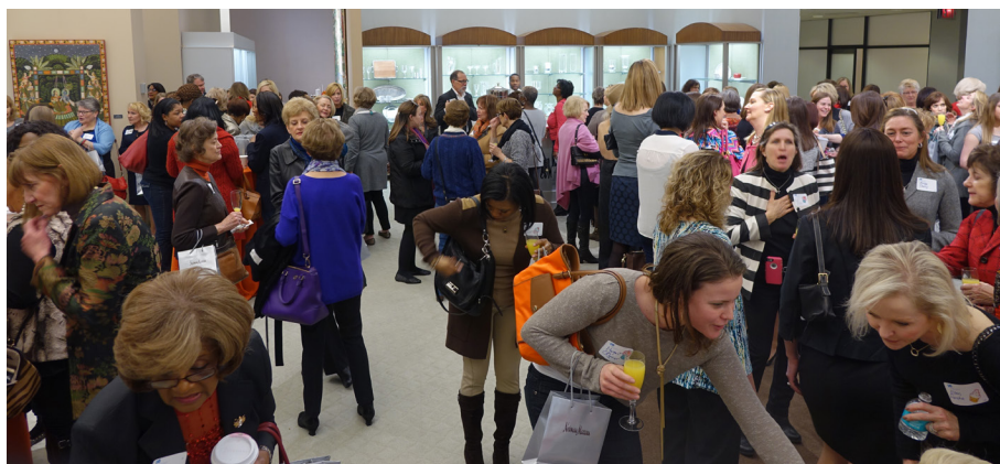
Guests gathering to enjoy mimosas and brunch bites as the party begins.