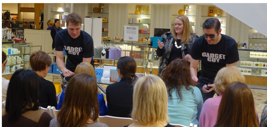
Guests getting helpful beauty and skincare information at the various beauty bars.