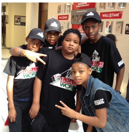
Triple T's & Leadwork Junior All Stars