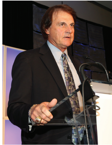
Tony La Russa toasts long-time friend Mike Shannon