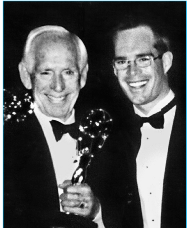
Jack and Joe Buck