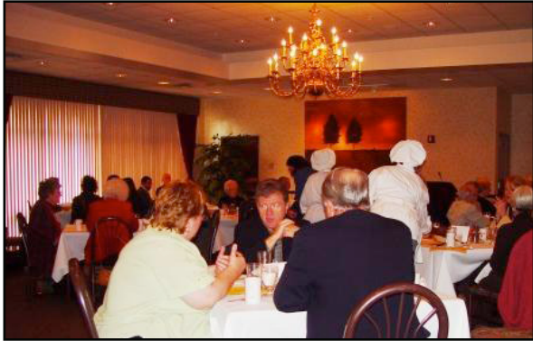
Press Club members and guests enjoyed a four-course luncheon prepared and served by St. Louis Community College hospitality students and faculty in the schools' elegant Anheuser-Busch dining room.