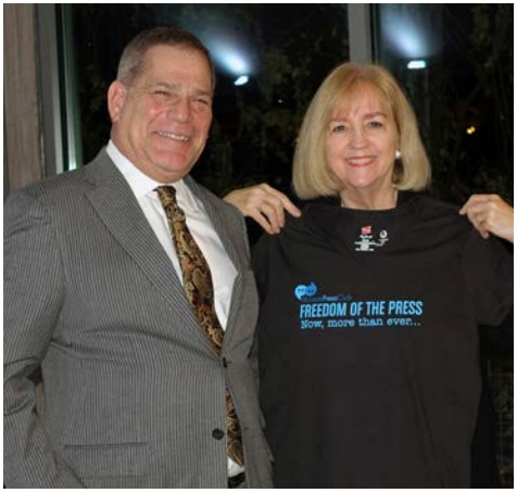
St. Louis City Mayor Lyda Krewson accepts a St. Louis Press Club "Freedom of the Press" t-shirt from William Greenblatt after giving a state-of-the-city talk to the members.