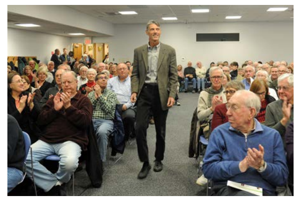
Author H.W. Brands.*