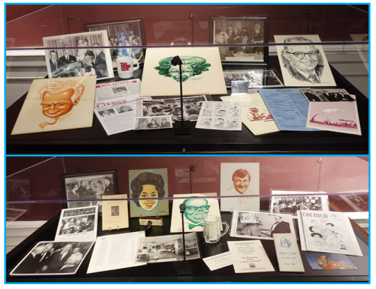
Displays of some Press Club memorabilia in the Media Archives.