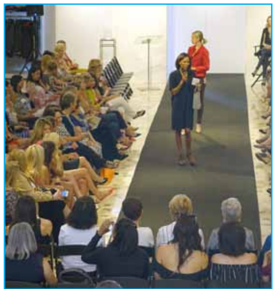
Guests enjoy Zodiac Room brunch bites, mimosas and beverages.