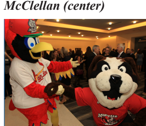
Cardinals' Fredbird and Maryville's Louie entertaining guests at the reception