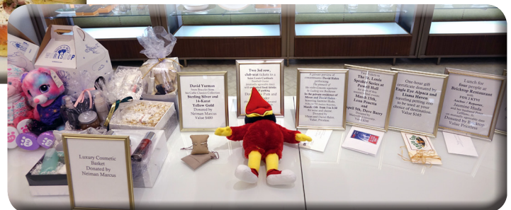
A sampling of the morning's fun shared by everyone at Beauty Buzzzz!